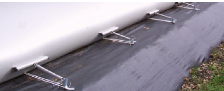
Through flexible anchorage, it is in the right position at every liquid level.

Albers Alligator delivers its products both nationally and internationally. Local dealer networks are used to make this possible. This means that there is always an expert nearby. The Bagtank is used in a large number of markets, such as industry, civil engineering and agriculture.