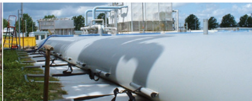
The Alligator Bagtank is suitable for industrial applications.