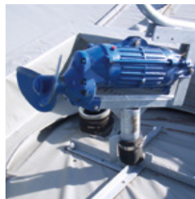
Mixer on mixerbase.